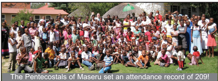
The Pentecostals of Maseru set an attendance record of 209!