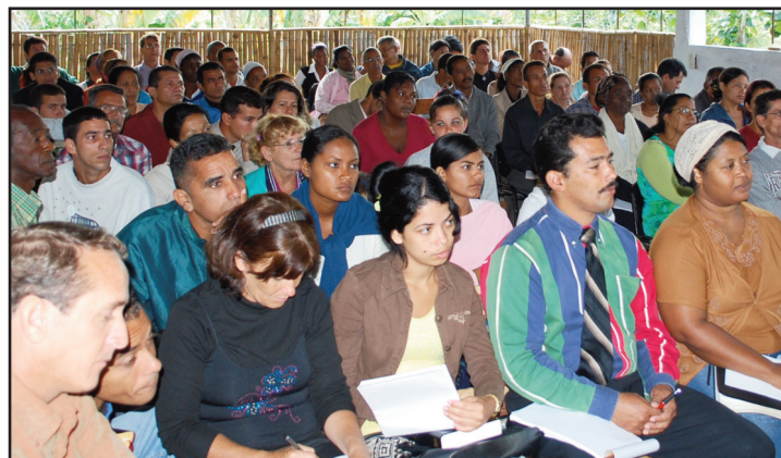
MASTHEAD PHOTO: The first public seminar of Jesus Name Pentecostal Church in Cuba! Thank God for revival in Cuba!

If you would like to contribute to this cause, please send your offering to the Foreign Missions Division, 8855 Dunn Road, Hazelwood, MO 63042. Please designate your offering to Liberian Motorcycles or to account number 103.FA1010F.033215.24.2411.__.201.